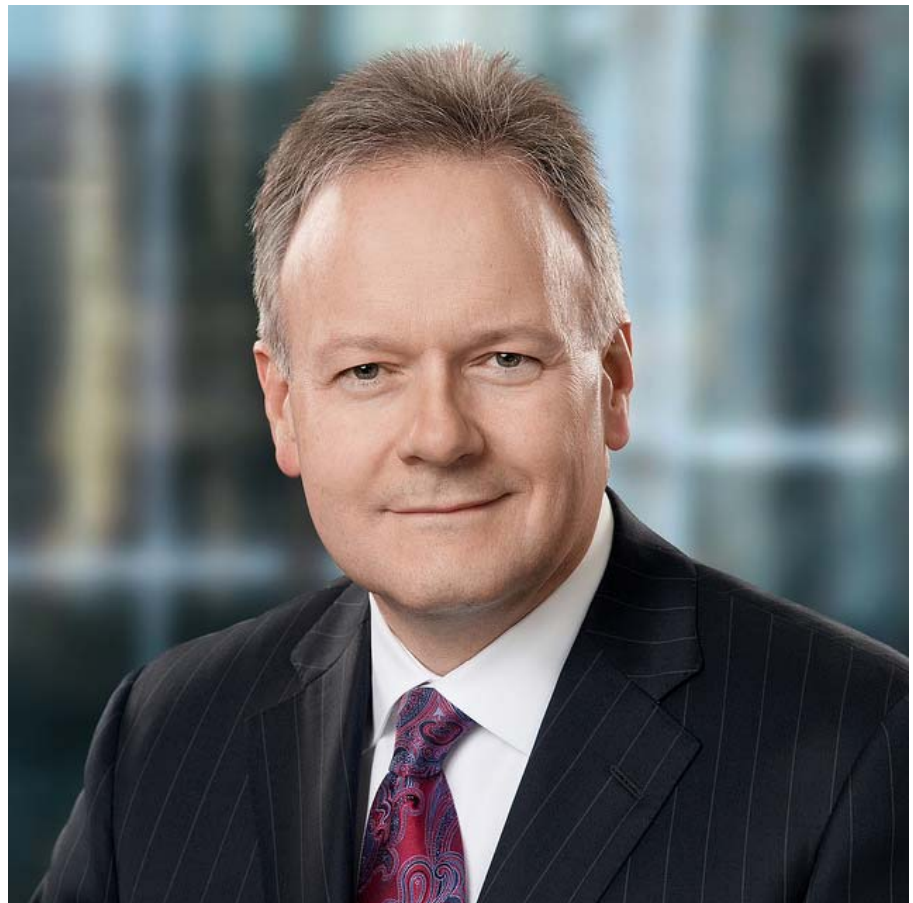
Stephen S. Poloz, Governor, Bank of Canada

The head of the Bank of Canada is the Governor. The name of the Governor is often quite familiar to Canadians because it appears on every bank note.