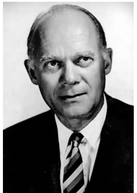
Louis Rasminsky, former Governor, Bank of Canada 1961-1973