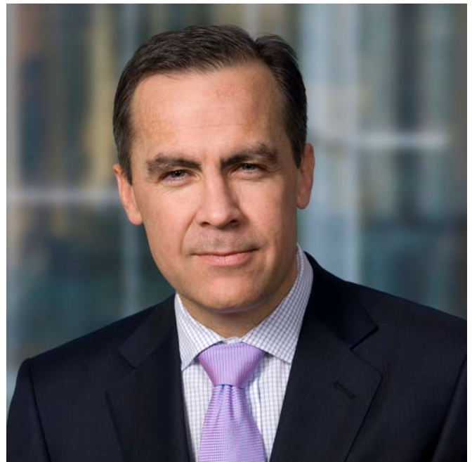
Mark J. Carney, former Governor, Bank of Canada 2008-2013

Let's examine this relationship between the Bank of Canada and the federal government in a little more detail.