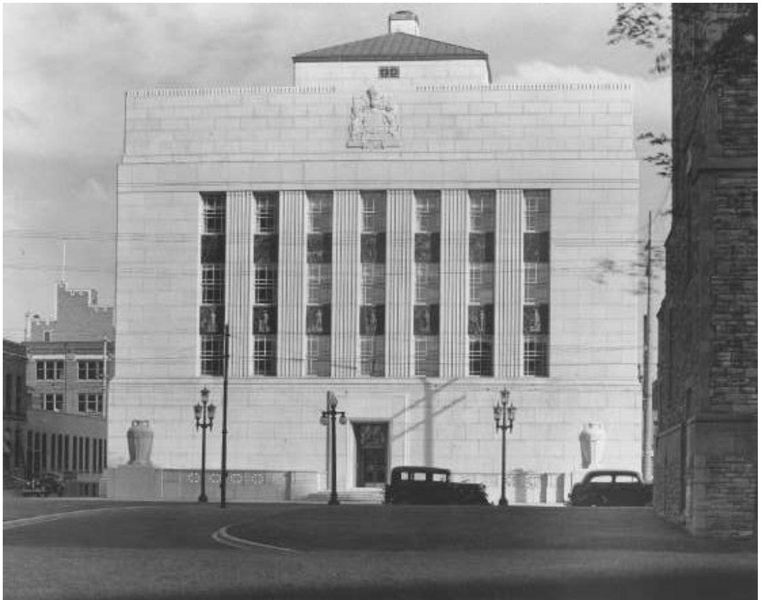
Bank of Canada, Wellington Street, c. 1938

Private ownership of the Bank of Canada did not last for long, though. The government bought the publicly held shares over the course of the first few years. By 1938, no citizen held any shares in the Bank of Canada, which was publicly owned by the Government of Canada on behalf of the people of Canada.