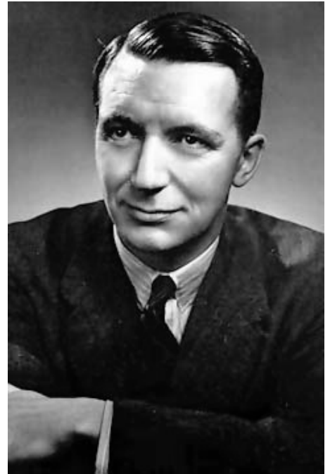
James Coyne, former Governor, Bank of Canada 1955-1961

So, although the Governor and the Bank may have considerable independence, the government holds the final responsibility for monetary policy through its ability to issue a directive to the Governor. In other words, the Minister of Finance is ultimately responsible for both fiscal and monetary policy on behalf of the government. But, since 1961, Canada’s governors and ministers of finance have been able to agree on the appropriate policies of the Bank, and a directive has never been issued. It is unlikely that will ever occur now with the inflation-control agreements reached by the Bank with the government.