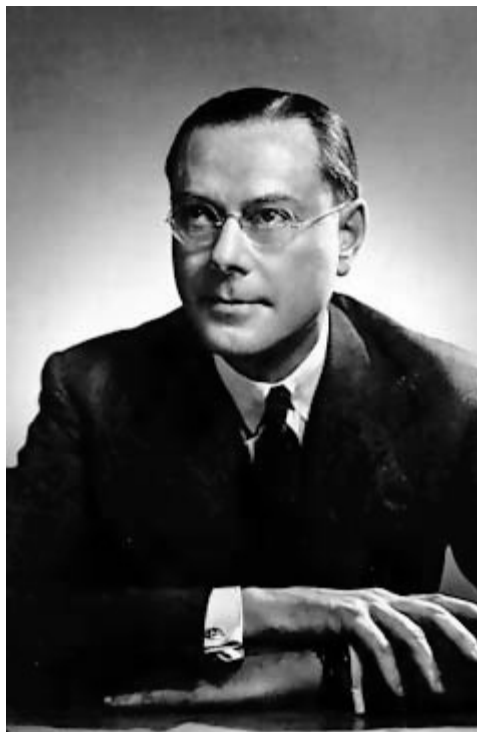
G.F. Towers was appointed as the first Governor of the Bank of Canada

http://www.bankofcanada.ca/about/history/ .